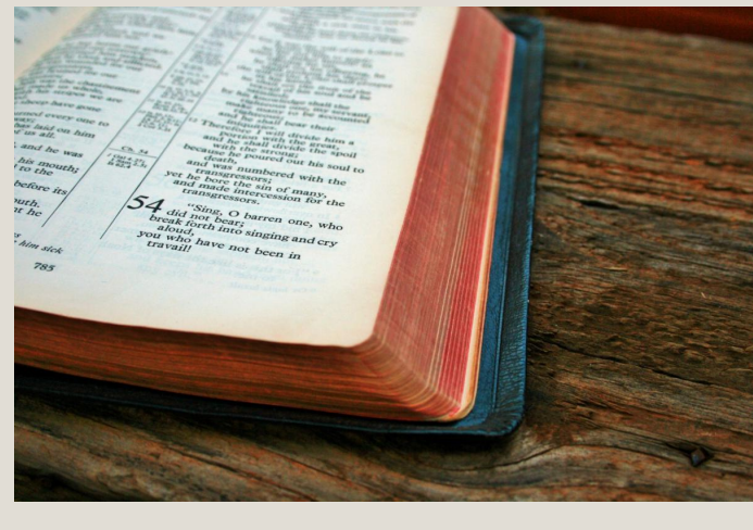
Adult Bible Study